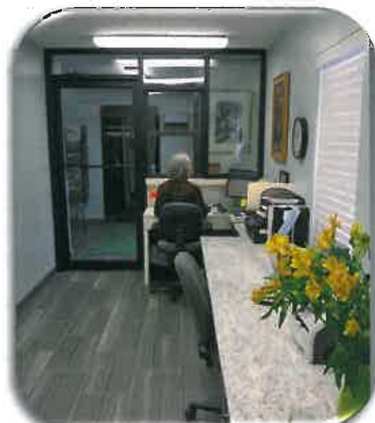
Administrative Area/Enclosed Lobby