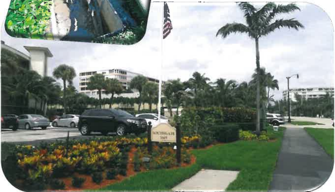
Southgate frontage upon completion of feed line relocation