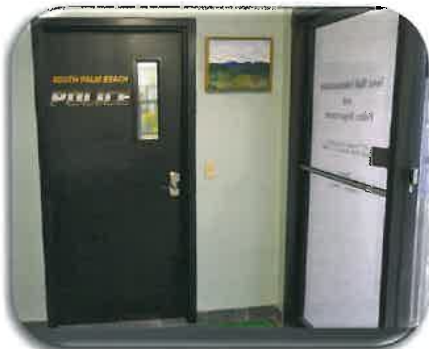
Police Department's Security Door

Town Hall has been enhanced with new equipment and security upgrades. A security door to the police department has been installed and the lobby has been closed in, including a new door to provide a secure work environment for our administrative staff. New porcelain tile floors were installed throughout the work area in the Police and Administration areas to replace the building's original flooring. Energy efficient LED lights and ceiling fans were installed in the police parking garage. To increase building security, a number of high tech security cameras have been installed on the interior and exterior of the building. This system records all movement inside Town Hall and the surrounding area 24/7/365. And lastly, new television equipment was installed in the Town Council Chambers to provide the audience with visual presentation materials at Council meetings and special events.