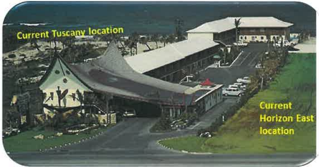
Palm Beach Hawaiian Ocean Inn – Back in the Day

During the past four months exciting progress has been achieved by the developers, 3550 Holdings LLC, as they advance their new 30 unit luxury condominium development project. Between November 2015 and February 2016, the original seawall was demolished and a new seawall was constructed in accordance with the demolishment and construction permit. Both the Town of South Palm Beach's Building Department and the Florida Department of Environmental Protection oversaw every step of this project to ensure that it was done in full compliance with the local ordinances, building codes, and State rules and regulations.