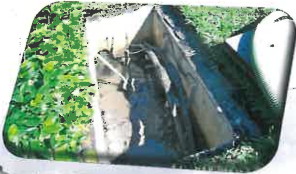
FPL's concrete connector vault/ box

The first agreement the Town entered into was a Release of Property Damage Claims voluntary agreement with FPL whereby FPL settled the claim for $16,350 to correct the problem believed to be caused by their vault. The second agreement reached by the Town was a Letter of Understanding with Southgate Condominium Association, Inc., wherein the Town agreed to pay Southgate the $16,350 and an additional $7,700 from the Sewer Fund for elements of the project located within the Florida Department of Transportation's right of way. The project commenced on October 6, 2015 and was successfully completed on March 1, 2016.